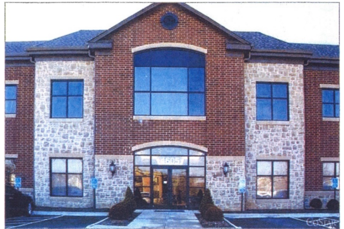
Our office is on the 2 nd floor with stair and elevator access.

Turn right on Kenwood Road, turn right on Galbraith Road. The Resonate office is on the left, past Jewish Hospital.